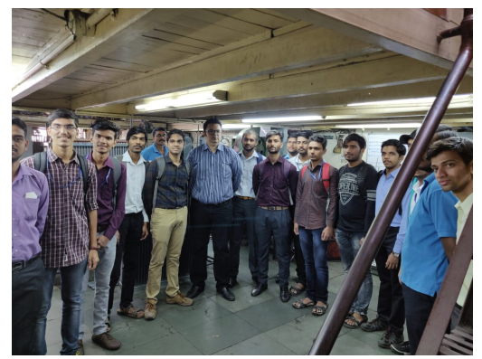
AURO Engineering IV 8/2/2019 Sakinaka, Andheri