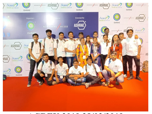
ACREX 2019 28/02/2019 Bombay Exhibition Centre