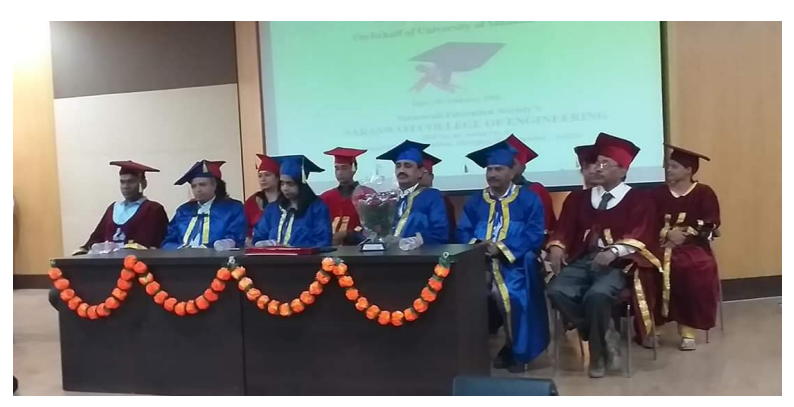
HOD's of all departments