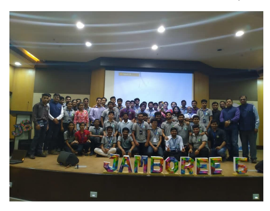
JAMBOREE-6: 19/01/2019 Saraswati college of engineering, Kharghar