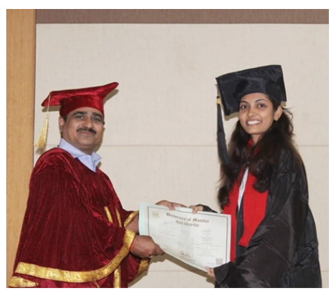
Felicitation by HOD