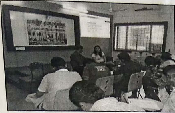
Training sessions for final year students

companies like Marathon reality Pvt. Ltd. EMCO Pvt. Ltd. Akruti City Gold Pvt. Ltd. Etc.