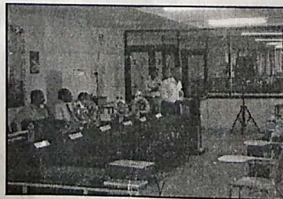
Dignitaries of Inaugural Function

On the last day all the delegates were delighted to receive training on such a important topic. Also they expressed that the knowledge of recent amendments & developments in building By-Laws of Corporations & IS Codes of practice for earthquake resistant design is a must for every Engineering Graduates.