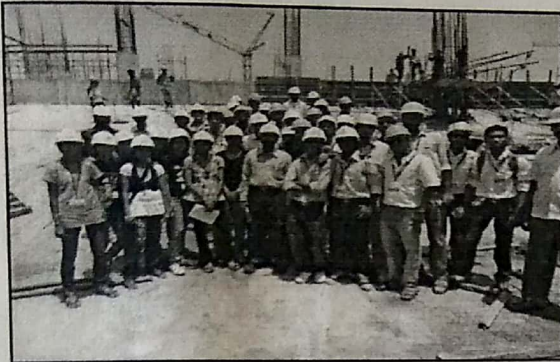
Bangalore metro project