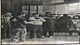
Paint Ball Competition