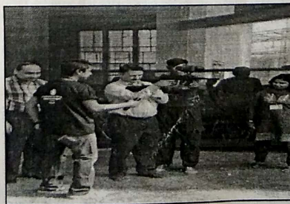
Paint ball Competition

This was the unique event which was most enjoyed by all the faculties and students. Virtual war like situation is created for the participants & paint balls are used as rifles in the gun. The program got huge response & participation from all the faculties & students of SCOE.