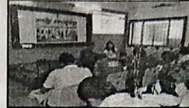
Training & Placement