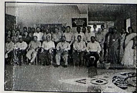
Participants of STTP