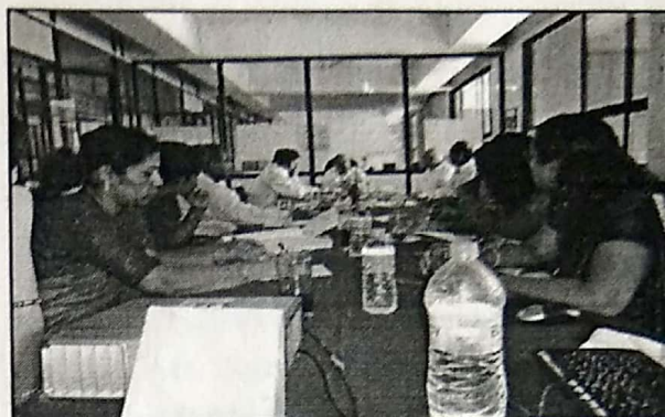
Advisory Board Meeting

maintaining quality of lab testing so as to promote consultancy assignments as well as stress was given to start Non Destructive Testing. Several other issues like development of labs, projects for final year students, vocational training & placement for students, faculty training etc were discussed.