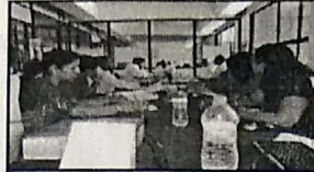
Advisory Board Meeting