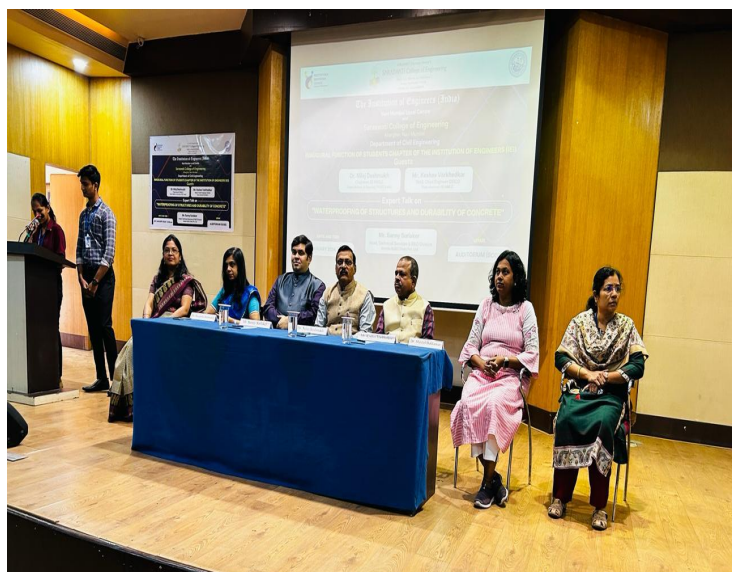
Introduction of Guests by Students