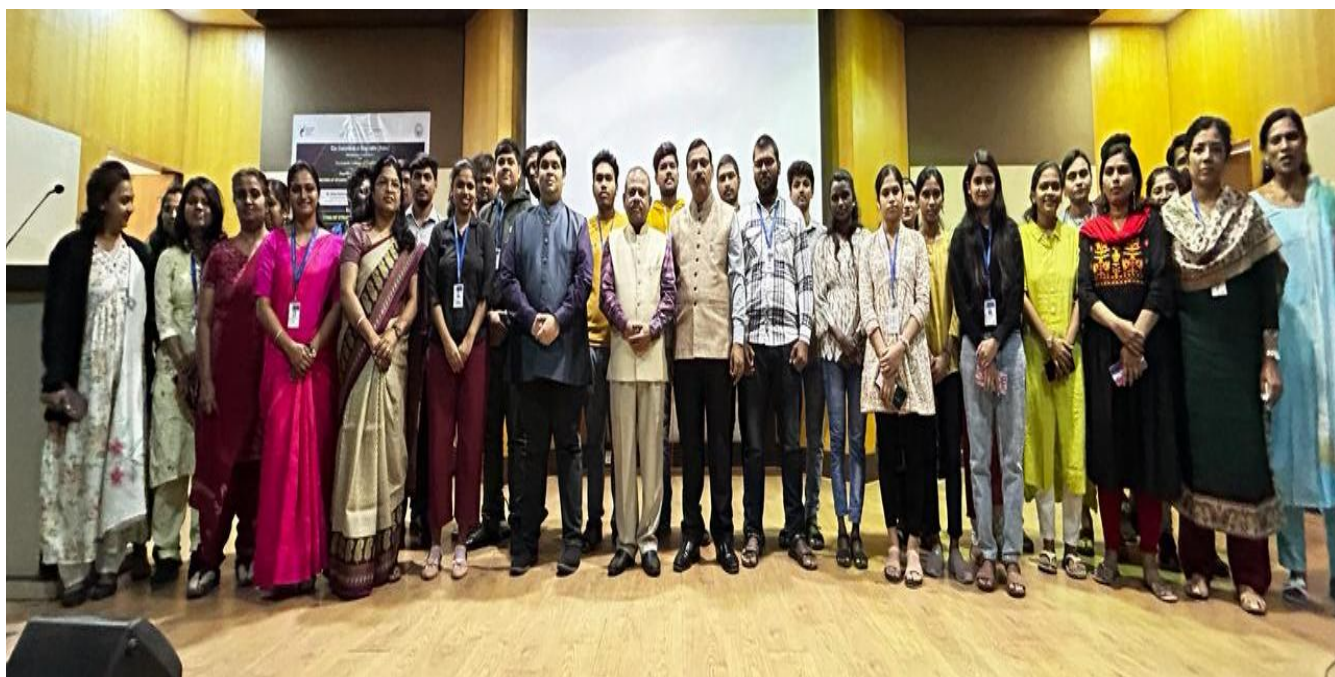
Group Photo with Guest, Faculties and Student Committee members.