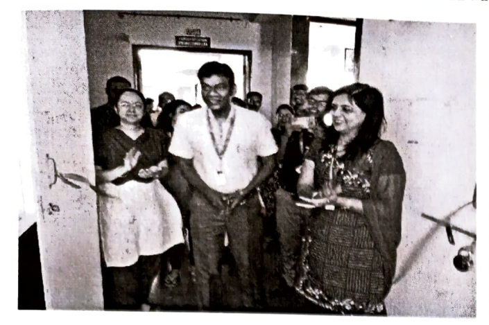
Inauguration of Avishkar-2017