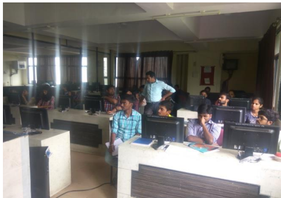
Image of Online Quiz Conduction.

They provided an extra video which consist of Problem solving exercise questions which allow students to solve and learn advance python deeply. They also conducted Q&A through online assistance https://appear.in and quiz session of 15mins for every session through their online portal https://yaksh.fossee.in/exam and the certificates will be provided with grades based on the quiz exams