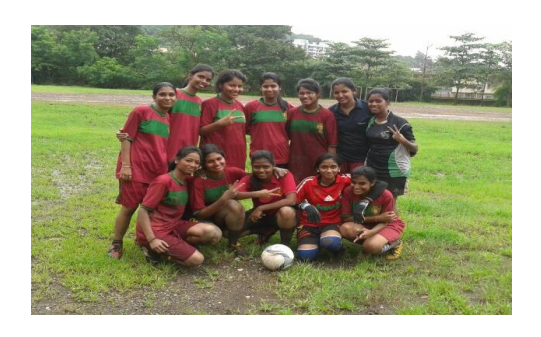
FOOTBALL TOURNAMENT IN MIT PUNE HELD ON (19/9/13- 25/09/13)

2) Participation in Football Tournament (MIT-PUNE)