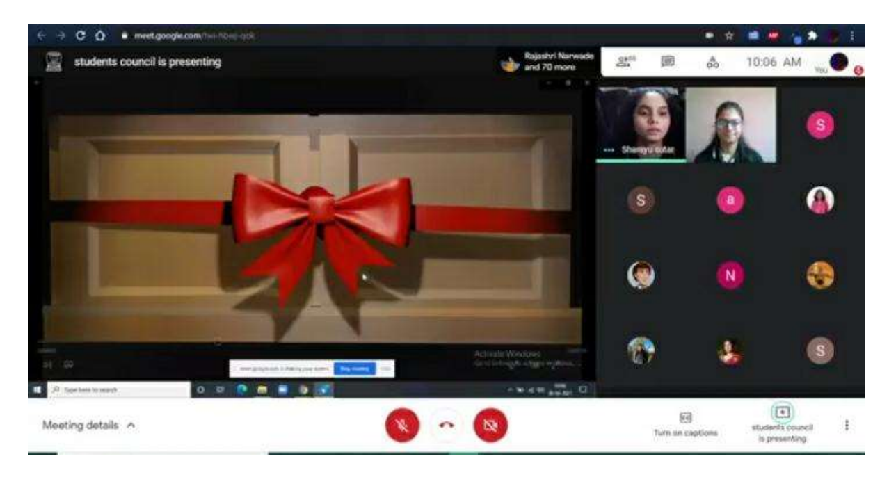
Pic name: Ribbon cutting (through video)