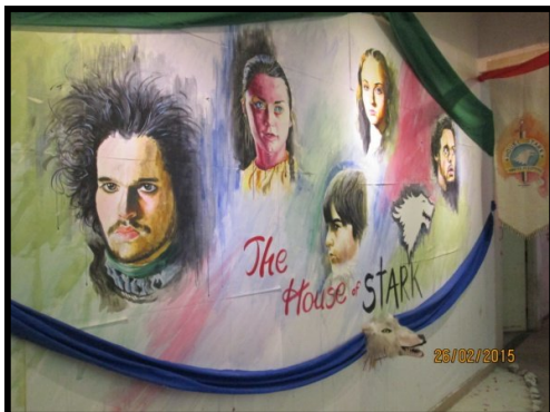
Theme given to Automobile Department was HOUSE STARK Due to Students efforts Department Won 2nd Prize in it.