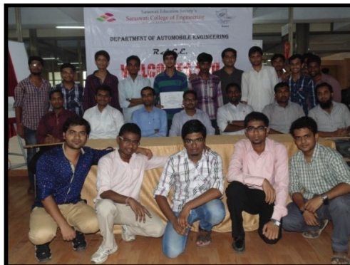
“NexGen 2025” intercollegiate sketch competition for FUTURE AUTOMOBILE enthusiast held on FOUNDATION DAY 17 th September, 2014.