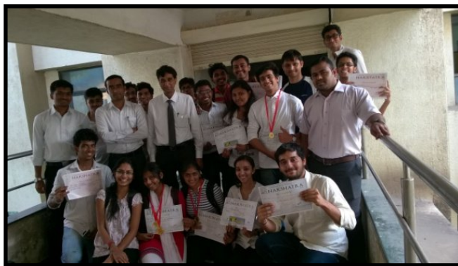
Winners, Event heads and Co-ordinators in Nakshatra 2K15 with Faculty and HOD.