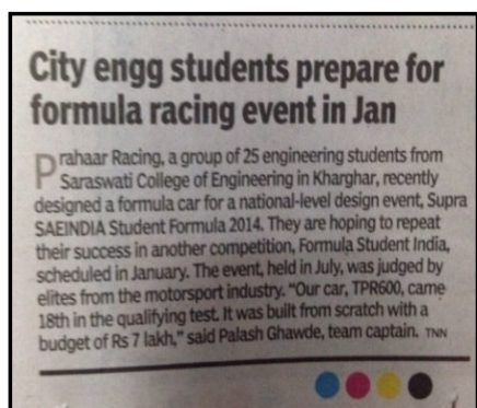
8. "PRAHAAR RACING" newspaper article in Times of India and DNA Navi Mumbai.