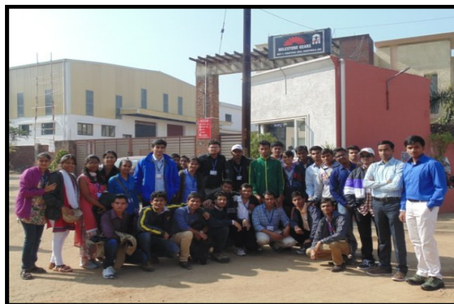
“INDUSTRIAL VISIT” at “Milestone Gear Industry” in Baddi and at “Micro Turners” plant in Chandigarh in February 2015.