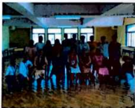
AISA TEAM MEMBERS

Our Student's Association "AISA" plays major role in shaping the career of our students by conducting various co-curricular and extra-curricular, technical, cultural, sports and extension happenings throughout the year. Students joined offline college from the month of January and Student Association was formed. Elections were conducted for the same and the following members were selected in the association.