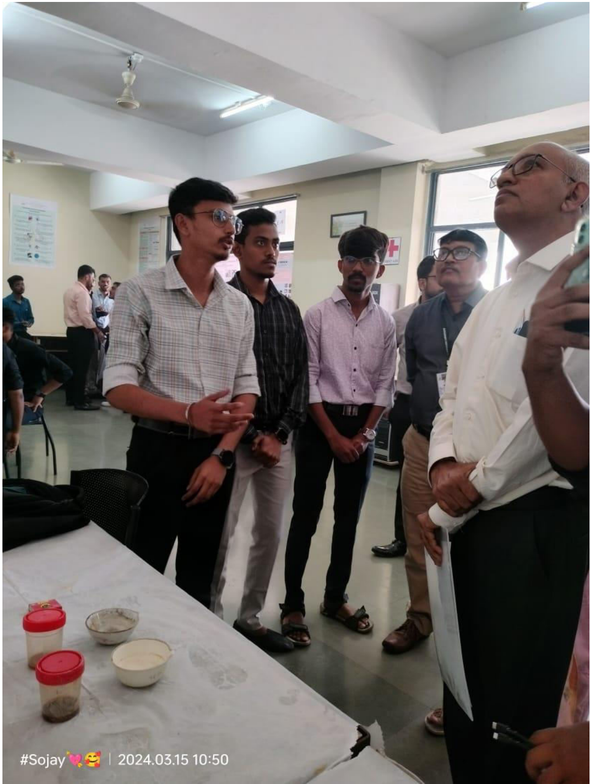
#Sojay 🍷🥰 | 2024.03.15 10:50