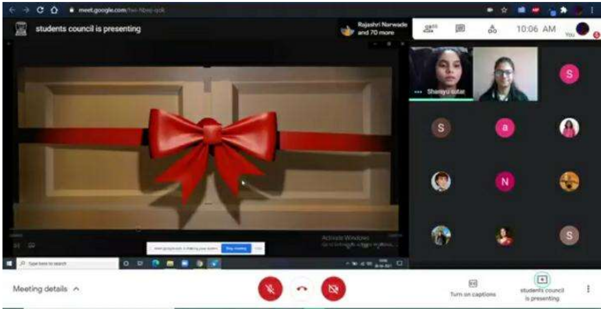
Pic name: Ribbon cutting (through video)