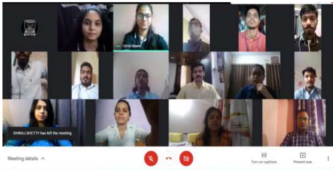
Pic name: Inguration ceremony