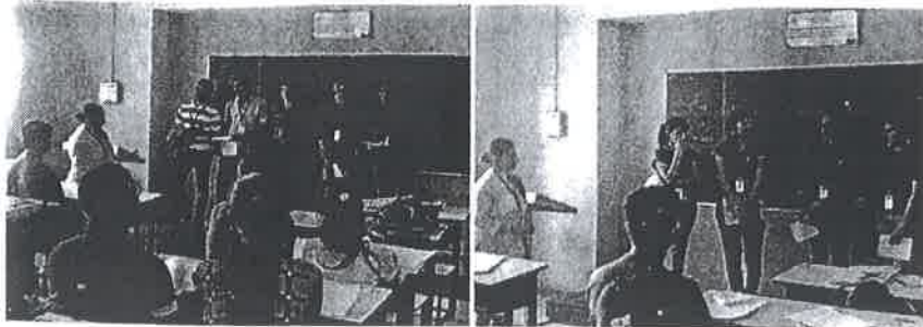
Student Group Tasks