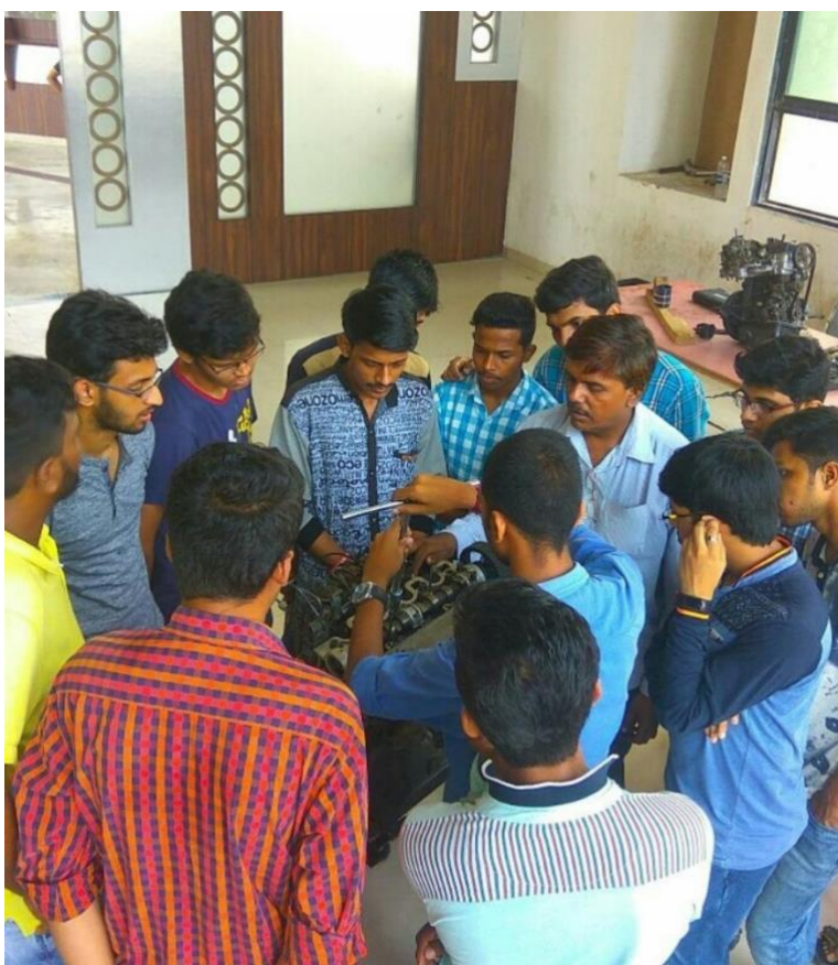
IC Engine Workshop in association with Auto Institute (06-Oct-2017 to 07-Oct-2017)